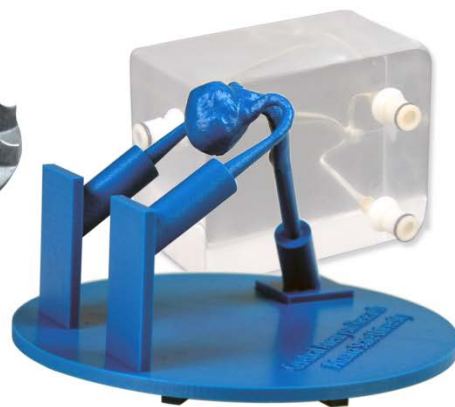
Advanced Medical Research